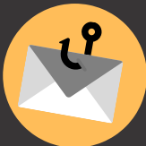
Phishing emails removed in 2022