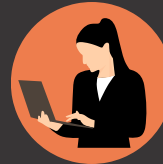
Active Omni CMS editors as of FY2023 end