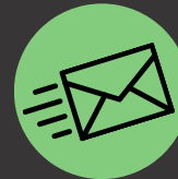
Emails answered CY2022