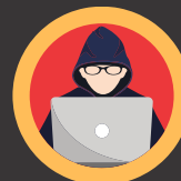
Phishing campaigns identified in 2022