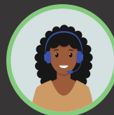
Calls answered CY2022