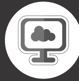
Historical data logged and stored as of January 2022