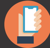
Usability participants CY2023