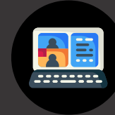
Zoom meetings for May 2022 - May 2023 in the main campus account