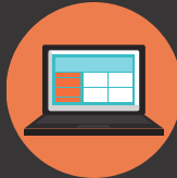
Omni CMS websites for U colleges, departments, and organizations as of FY2023 end