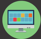
Average number of help tickets resolved (industry average is ~65%) CY2022