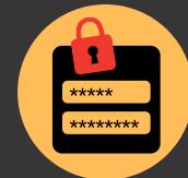
Logins via Central Authentication Services (CAS) in a typical 24-hour period