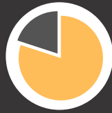
Devices monitored as of January 2022